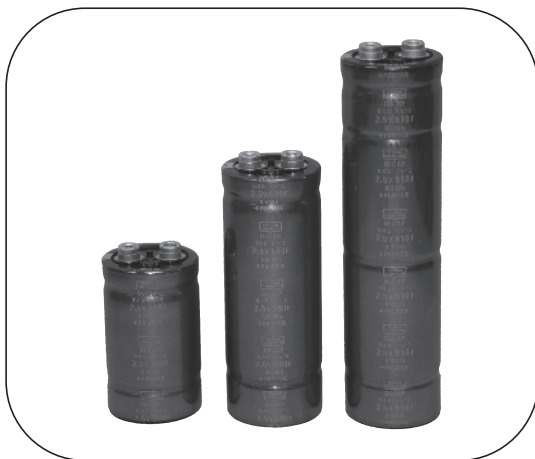
(Photo1) DLCAP™ Appearance

Using activated carbon for the electrode utilizing its very large surface area, and with our original high-density electrode manufacturing technology, we achieved both high capacitance and low resistance.