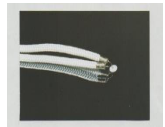
Tip of thermal coupler