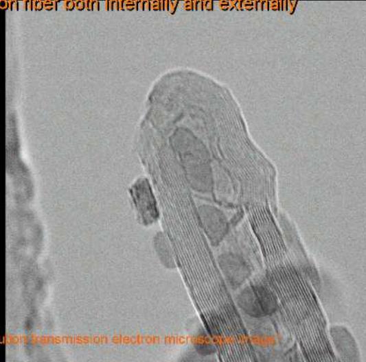
(High-resolution transmission electron microscope image)

Nanocrystalline lithium titanate ( \text{Li}_4\text{Ti}_5\text{O}_{12} ) mounted on carbon fiber both internally and externally